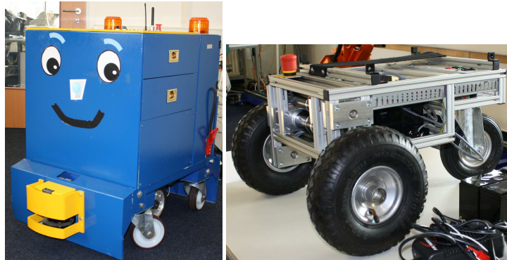
Fig. 3. Left: Handycart with a Sick PLS laser range finder. Right: A Volksbot RT3 controlled by a MacMini.

The concept could not be really evaluated since the course just started or given only once. Nevertheless the first evaluations from the students are very promising.