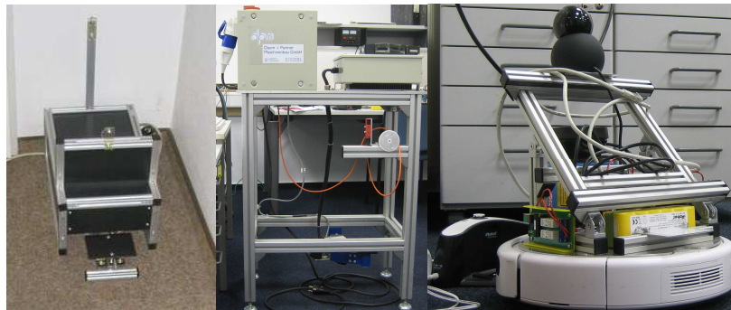
Fig. 4. Docking stations for the automatic battery charging. Left: VolksBot, Middle: Handycart. The arm is moving out if the robot it detected via infrared light, Right: The Roomba has an additional battery pack for the laser scanner and a digital relay card to switch power to the notebook if necessary.