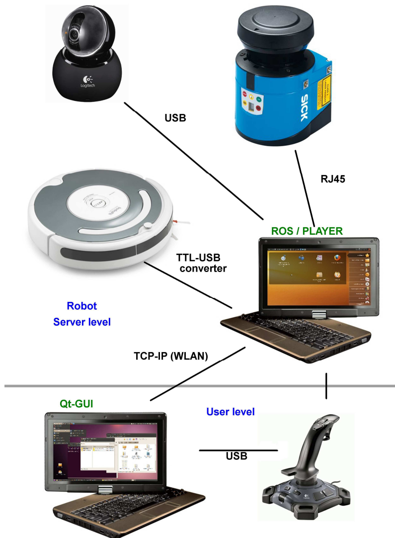
Fig. 5. Components and interfaces of the Roomba robot.